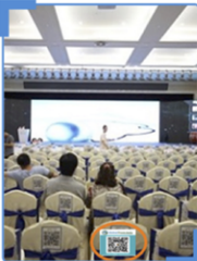
椅背贴广告(200张) AD placement on Chair-back(100) 10000RMB