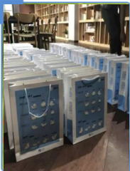
资料入袋(200参会者) Marketing materials put in gift bag (200attendees) 2000RMB