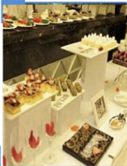
茶歇区广告 AD placement on Tea Breaker Area 5000RMB